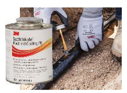
3M Electrical Coating FD